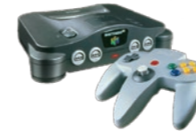
1996 Nintendo 64