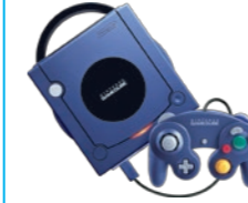
2001 Nintendo GameCube