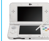
2014 New Nintendo 3DS New Nintendo 3DS XL