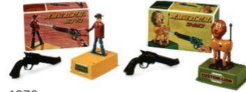
1970 Beam Gun series