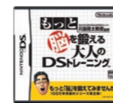
Brain Age 2: More Training in Minutes a Day