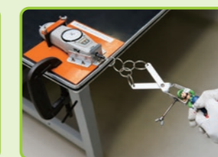
Checks whether parts can be pulled apart easily and, if so, whether they break off safely