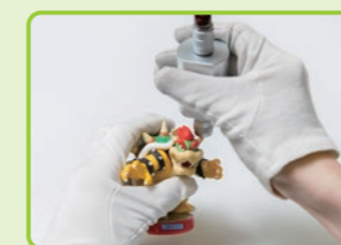
Checks whether pointed parts are dangerous

amiibo characters come in various shapes, and therefore require testing according to each of these shapes. We also ensure the safety and reliability of amiibo so that children can play with them safely. Here are a few of the tests we conduct: