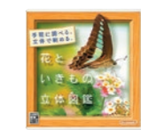
3D Pictorial Guide to Flora and Fauna