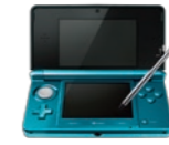
2011/2012 Nintendo 3DS Nintendo 3DS XL