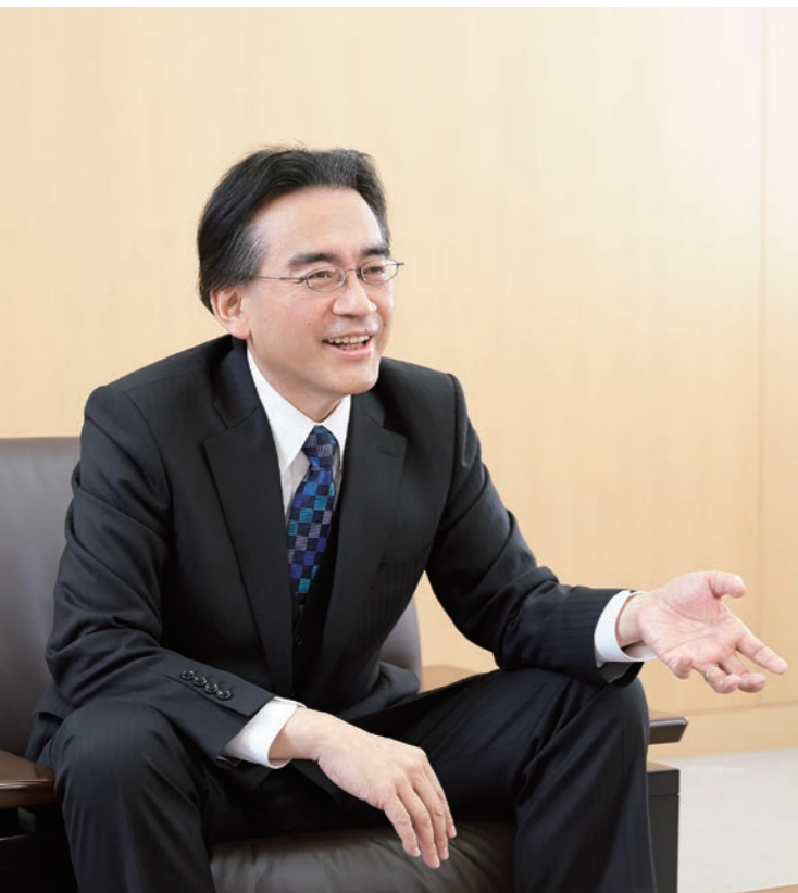
Satoru Iwata President, Nintendo Co., Ltd.