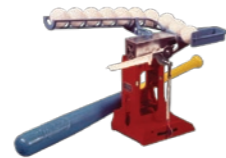
1968 Ultra Machine