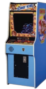
1981 Coin-operated arcade video game machine Donkey Kong