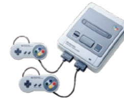
1990 Super Famicom (1991 Super NES)