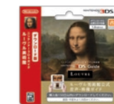
Nintendo 3DS Guide: Louvre

Nintendo 3DS has the same dual-screen and intuitive-operation features as Nintendo DS, but users also can enjoy playing games with stereoscopic 3D images. To fully utilize the dynamic capabilities of making characters seemingly jump out of the screen and creating a sense of depth, we released the 3D Pictorial Guide to Flora and Fauna and a 3D museum audio guide, further expanding the scope of video games.