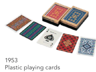
1953 Plastic playing cards

Since its establishment in 1889, Nintendo has continued to innovate itself in order to deliver smiles to generations. At Nintendo, our goal is to provide entertainment products and services that everyone can play easily with peace of mind, and enjoy with many other people. We will continue to seek out new potential for entertainment and put smiles on the faces of everyone Nintendo touches.