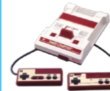
1983 Family Computer (1985 NES)