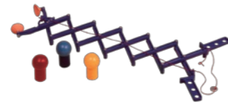
1966 Ultra Hand